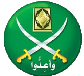
Figure 6 Egyptian Muslim Brotherhood Logo